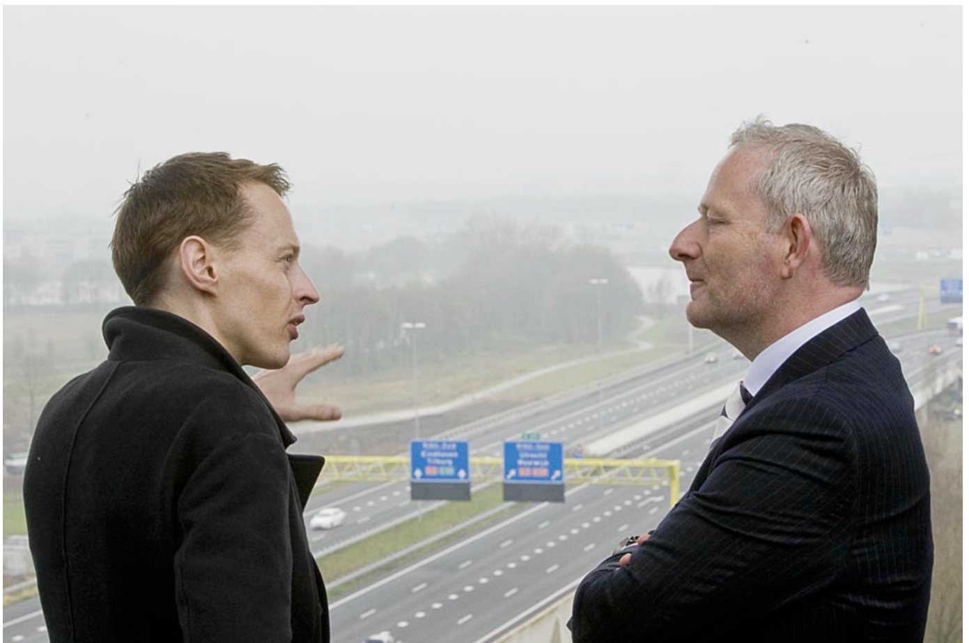
Daan Roosegaarde and director of Heijmans