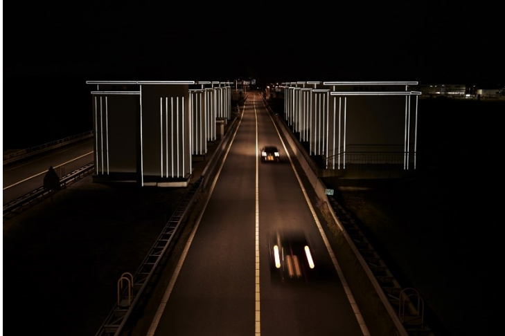
Gates of Light, Studio Roosegaarde