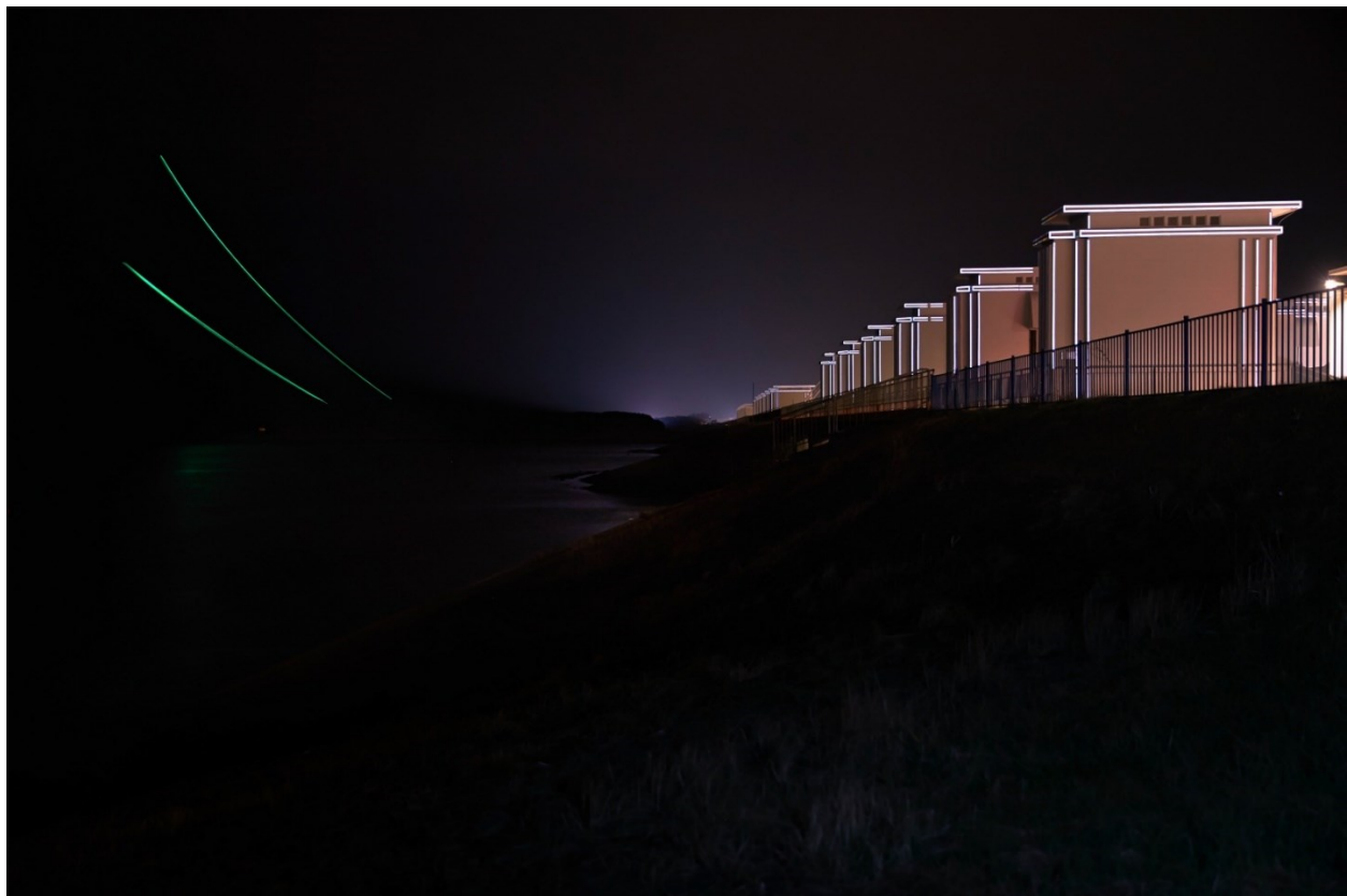
Windvogel and Gates of Light, Studio Roosegaarde