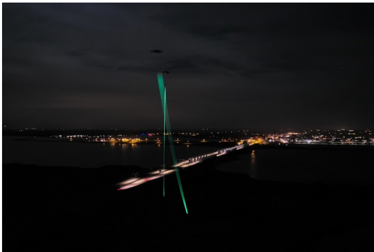
Windvogel, Studio Roosegaarde