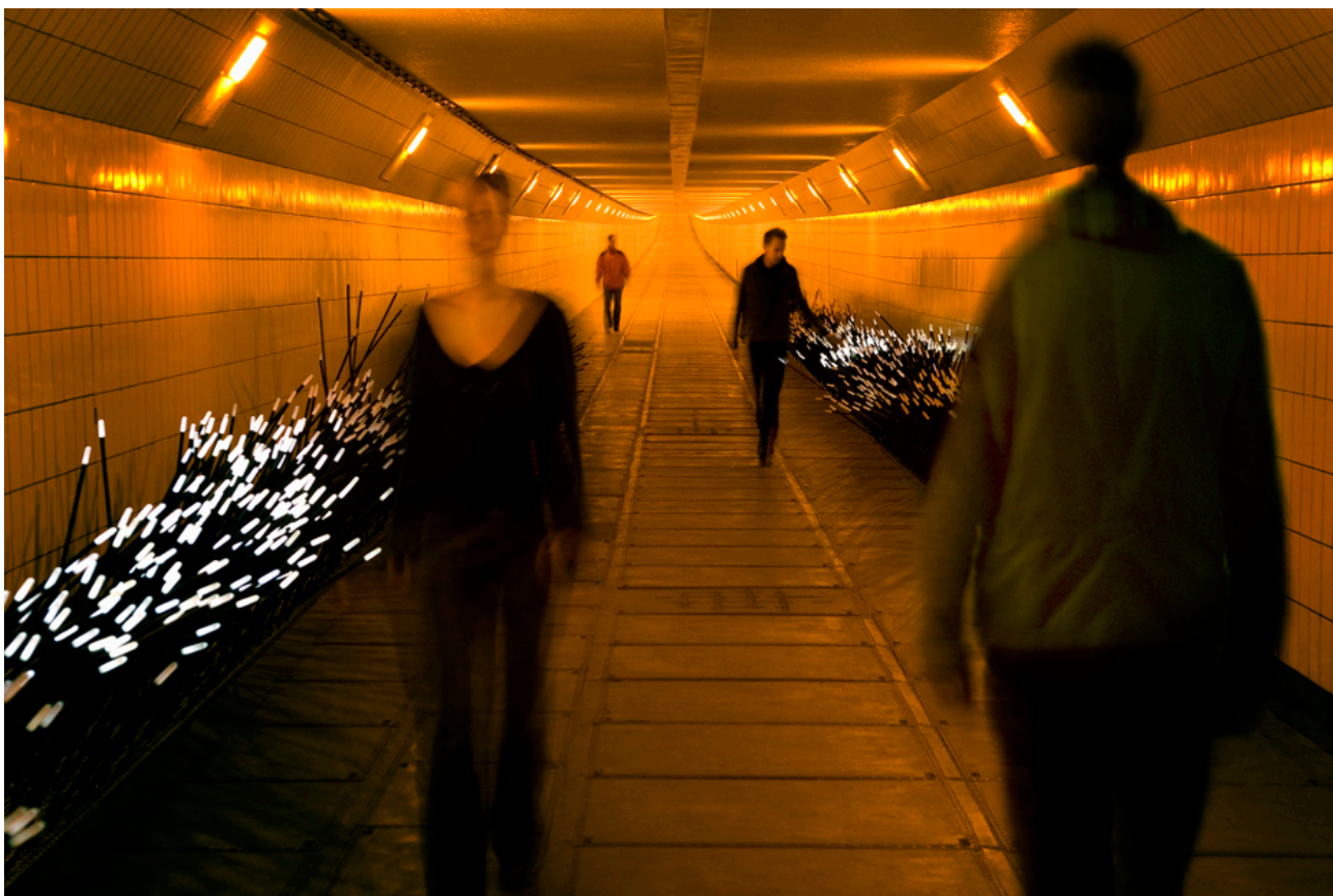
Side view at Maastunnel, Rotterdam NL.